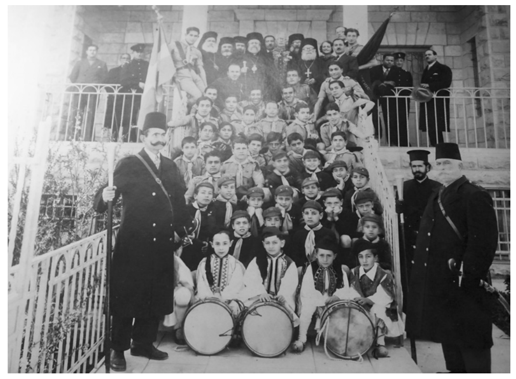
FIGURE 10.2 Greek boys in scout, cub and band uniforms with Patriarch Damianos at his Qatamon residence