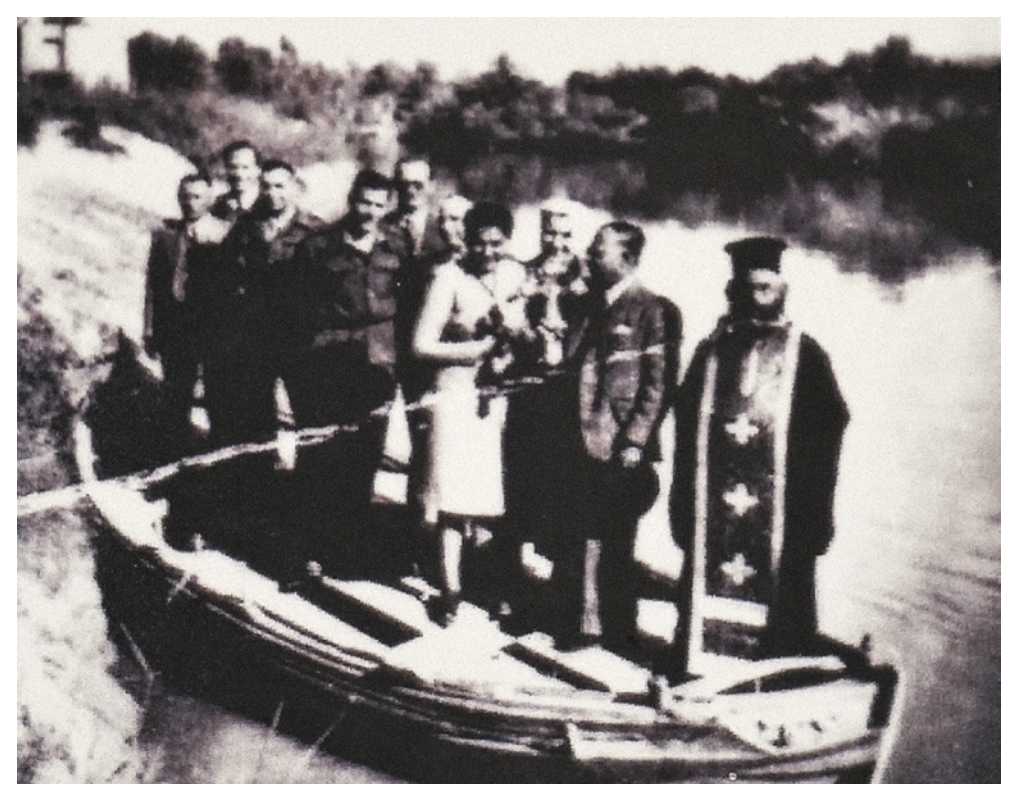
FIGURE 10.1 The Greek Club Collection: at the Jordan River

The attitude to the holy sites was just one example of the divides between the two sub-communities. Other differences often included wealth, education, professions (possibly class) and locations of residence in the city, all of which contributed to their separation from each other and also affected the language divide. <sup>18</sup>